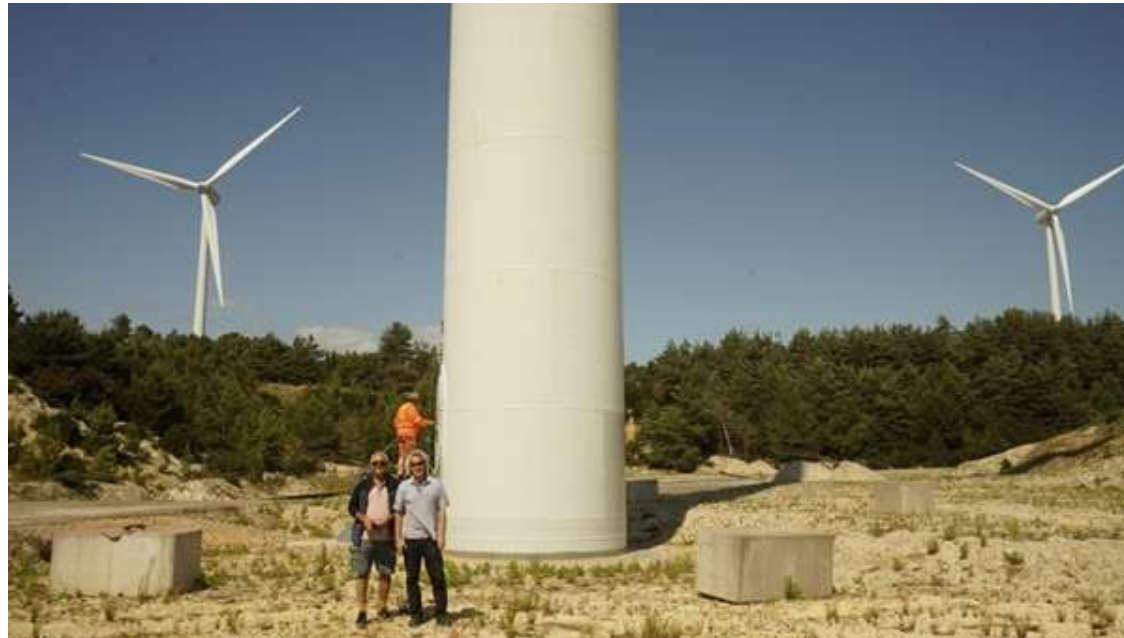
DCAN visit to Alaska Wind Farm, near Wareham